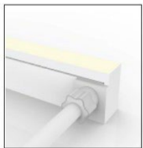
Left or right side entry